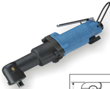
OP-310LHA F Side exhaust 側排氣